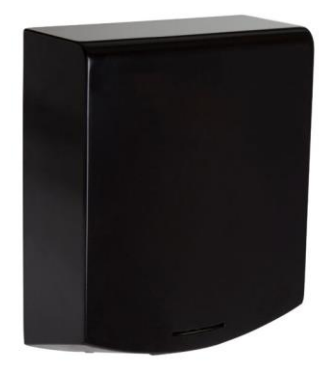
*ML ECLIPSE DESIGNER