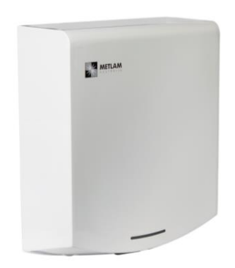
*ML ECLIPSE01 WHT