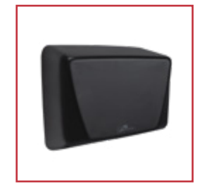
TURBO-Slim™ High-Speed, Compact Design Suitable For High Traffic Areas