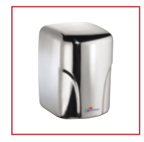
TURBO-Dri™ High-Speed, Robust Design Suitable For High Traffic Areas