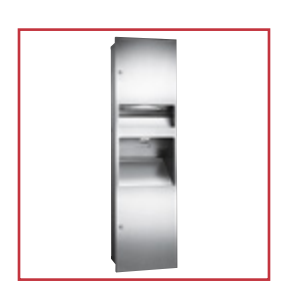
TURBO 3-in-1 Practical 3in1 Design Suitable For Any Washroom