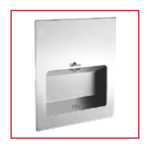
TURBO-Tuff™ High Speed, Recess Mount Suitable for High Traffic Areas