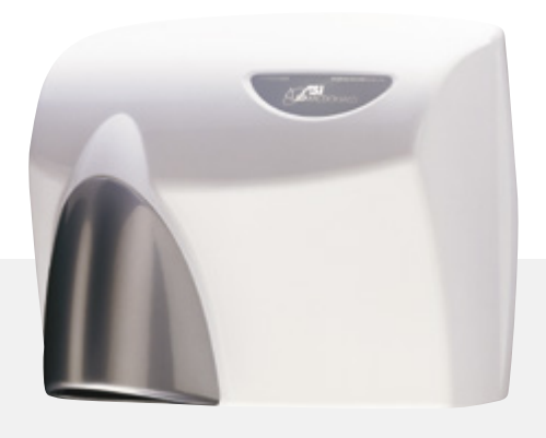
Decibel Level 63 dB-A @2M