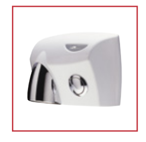
Touchdry Classic Design, Button Operation Suitable For High Traffic Areas