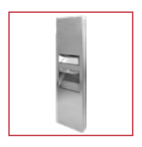
Select Classic Sophisticated 3in1 Design Suitable For High-End Washrooms

***NB - all models are suitable for use in Accessible Compliant washrooms***