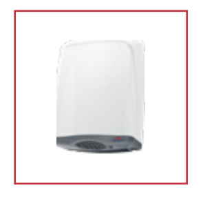
Applause Stylish, Ultra-Quiet, Suitable For Low Traffice Areas Requiring Low Noise