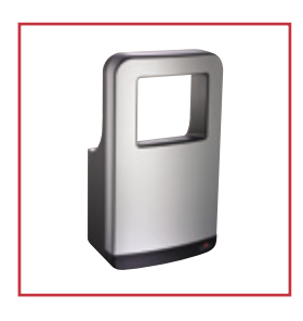
TRI-Umph™ High-Speed, Ultra-Fast Drying Suitable For High Traffic Areas