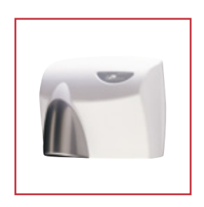
Autobeam Classic Design, Automatic Suitable For High Traffic Areas