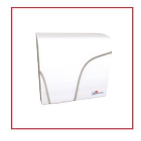
Applause Plus Low Cost, Automatic Suitable For Low Traffice Areas