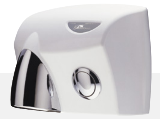
Decibel Level 64 dB-A @2M