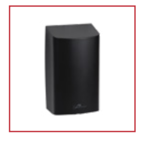
TURBO-Chic High-Speed, Elegant Design Suitable For High Traffic Areas